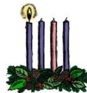
First Sunday in Advent

Christmas at the Cathedral: December 13-16. Visit www.ccfesd.org or call 605-988-3765 for tickets. This year's theme, "Unto Us" was inspired by the writing of the prophet Isaiah, showing God's immense love for us.